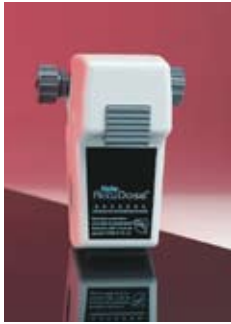
Hydro 3833-AG-2 Accudose, one button, Product Code #35377900