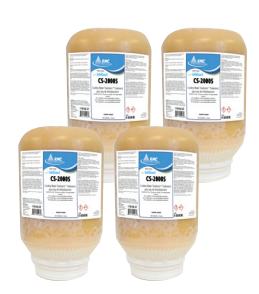
Solid Chemicals 4 - One Gallon Containers 8-10lbs