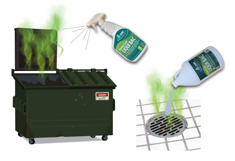
For handling and precautionary information, reference the product label and safety data sheet.

For more information about RMC call 1.800.836.1633, go to www.rochestermidland.com or